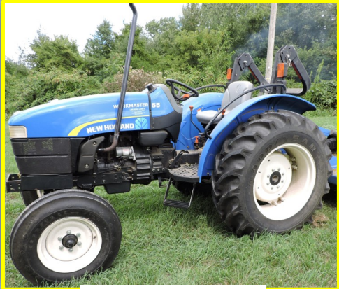
NH Workmaster-55 Only 60 Hours!

Located at 4179 Oxbow Rd. - Sodus, MI 49126