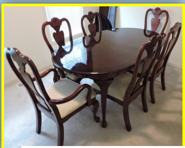
Nice Table & Chairs