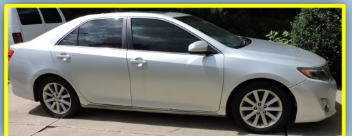
2012 Toyota Camry