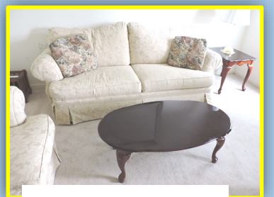
Living Room Items