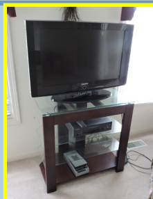
TV & Stand