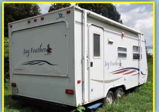
19 Ft. Camper