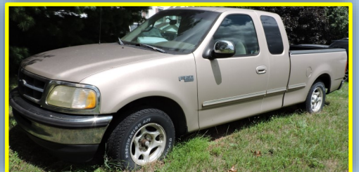
Ford F-150 Ext. Cab