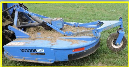
Woods 600 Chopper