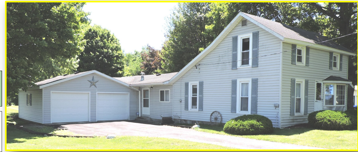
FRONT VIEW OF HOME

N.E. Of Cassopolis: North of M-60 on Penn Rd. (OR) South of Dutch Settlement Rd. on Penn Rd.