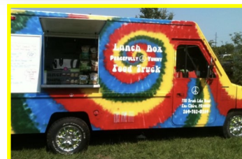
Lunch by Celena

Real Estate Offered At 5:00 P.M. View Day of Auction at 12:00 Noon